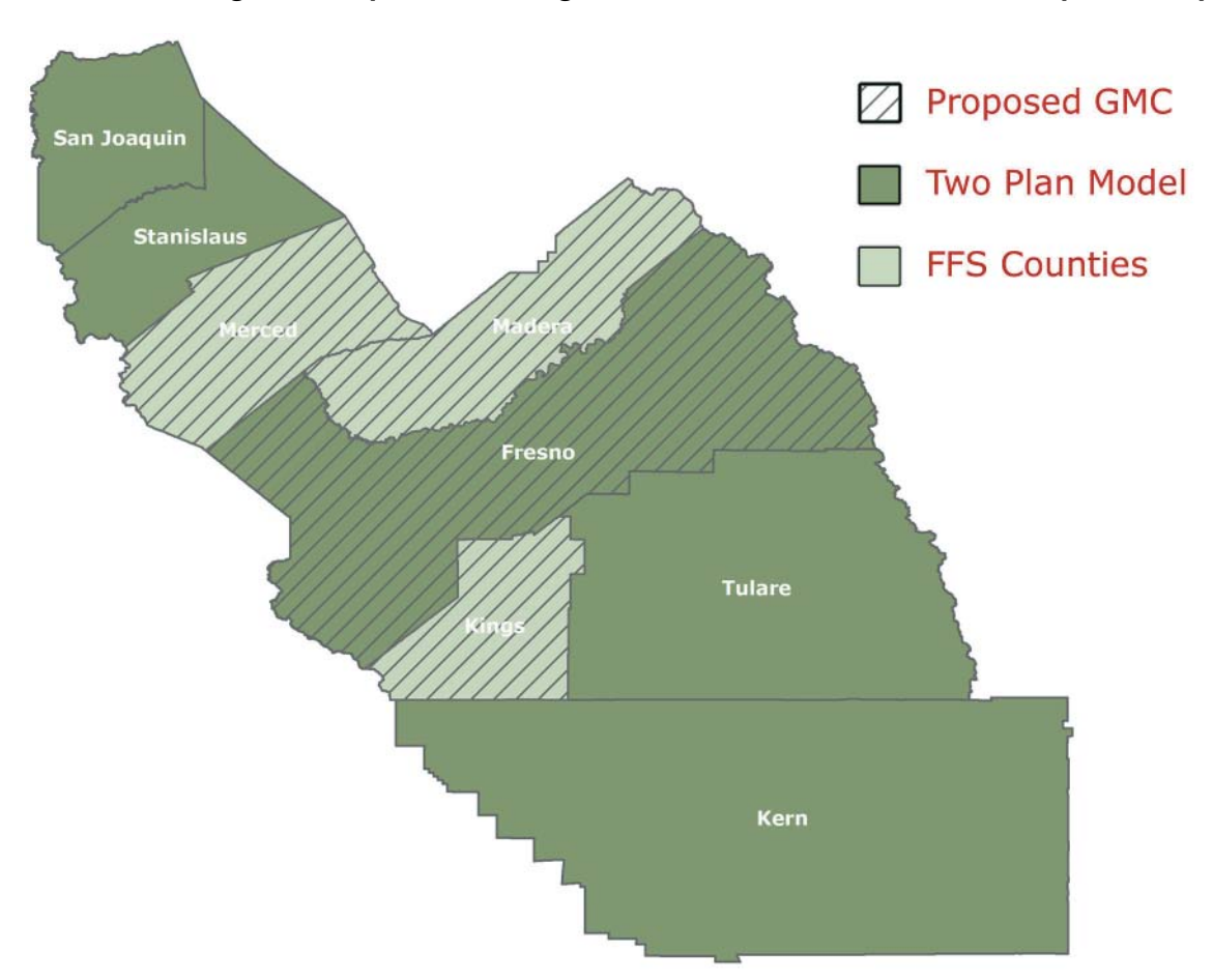
Figure 1 Distribution of Existing and Proposed Managed Care Counties in the San Joaquin Valley, 2005

The GMC model requires that all Medi-Cal participants select a managed care plan. Based on the experiences in San Diego and Sacramento, 5-10 MC organizations might compete for Medi-Cal members and be assigned, on a rotating basis, members who do not to select a plan. Forum participants pointed to three sets of concerns with this proposal: new access barriers, new burdens on providers, and reduced consumer choice.