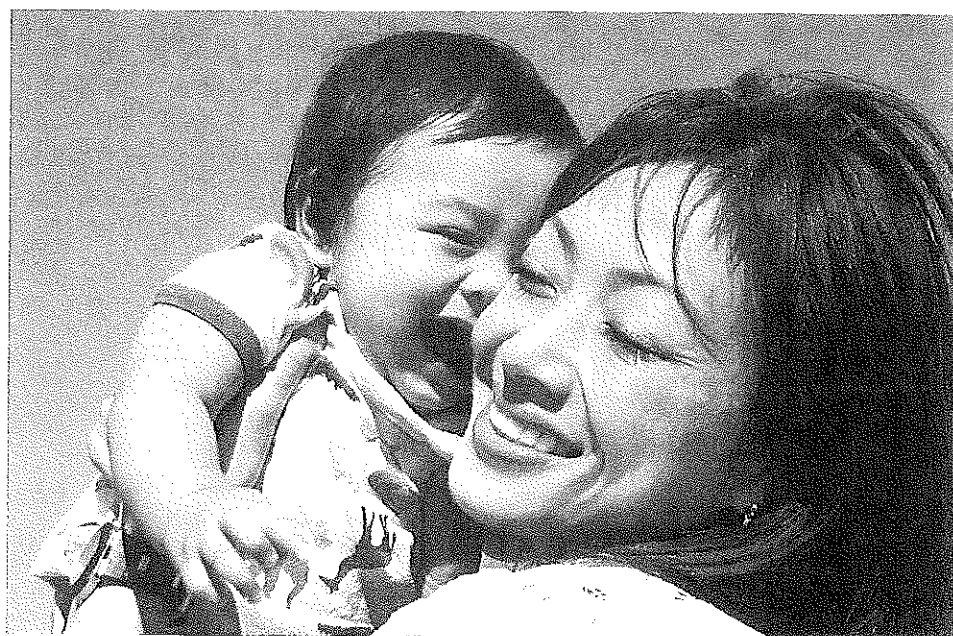
Early experiences, development, and relationships are of special importance throughout the life span.

The United Nations Convention on the Rights of the Child (Unicef, 2012) created a human rights treaty delineating the civil, political, economic, social, health, and cultural rights of children. It came into force in 1990 and has yet to be ratified by the United States despite its being embraced almost unilaterally by other members of