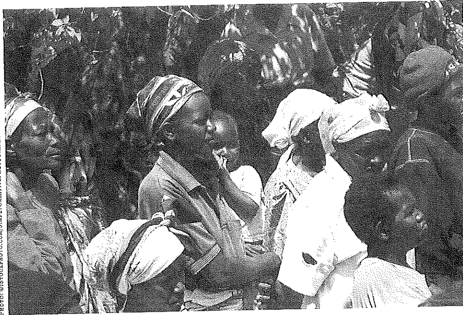
Those who promote the term infant mental health embrace a holistic view of the infant in the context of family and community.

the workplace, serving especially vulnerable families, striving for inclusivity). Such efforts are shared among all infant mental health professionals and supported by agency and community policies.