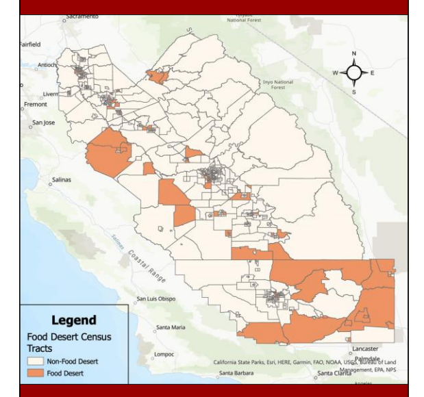
Figure 2. Geographic Illustration of Food Deserts by Census Tract in the San Joaquin Valley

Rural areas tend to be located in food deserts compared to urban census tracts.